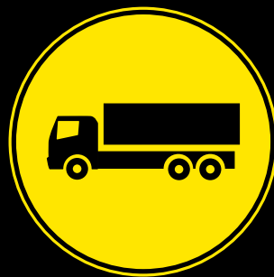
Poor quality of body repairs