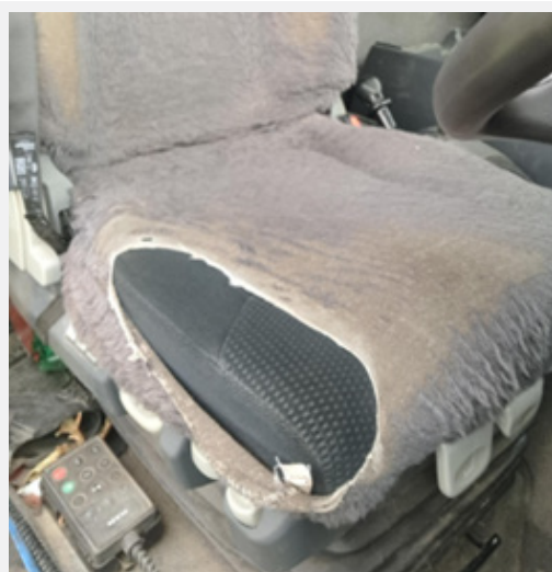
Fair wear & tear