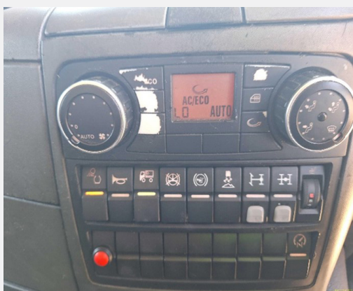
Fair wear & tear