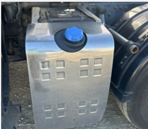
Fair wear & tear