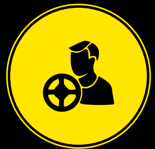
Drivers not taking responsibility for day-to-day care and maintenance of the vehicle