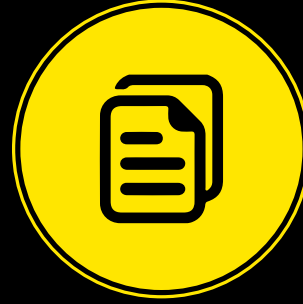
Non-adherence to vehicle manufacturer recommended capabilities and specifications