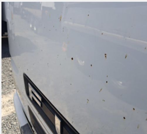
Fair wear & tear