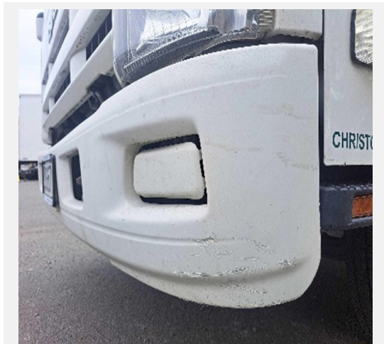
Fair wear & tear