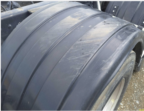
Fair wear & tear